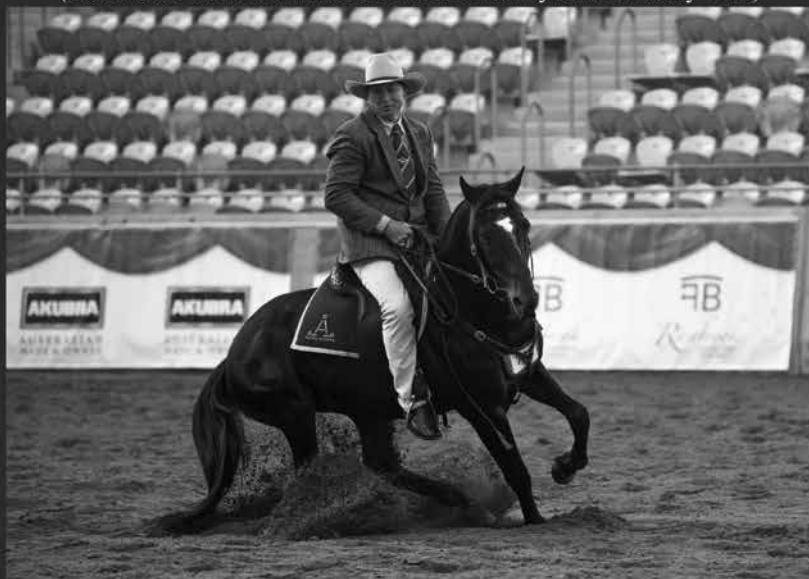
2021 National Show Supreme Working Horse

(Soda Justice-HSH / Starwaltz Cool Breeze-HSH by Brown Victory-HSH)